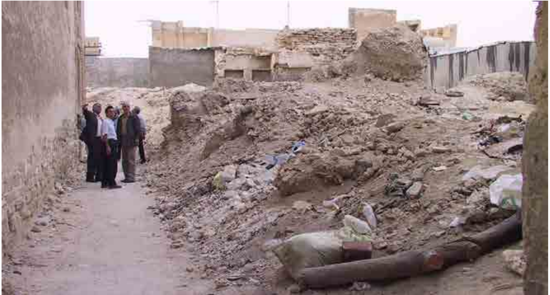
DEMOLISHED HISTORICAL BUILD BY INUNDATION

short distance between the sea and the buildings, caused the historical buildings and the built environment being demolished by inundation.