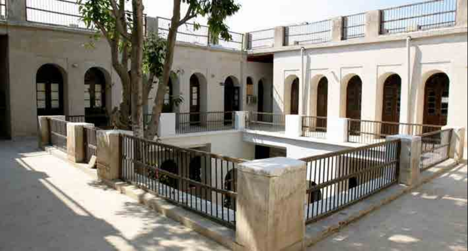
HISTORICAL HOUSE IN BUSHEHR(1900 AD)