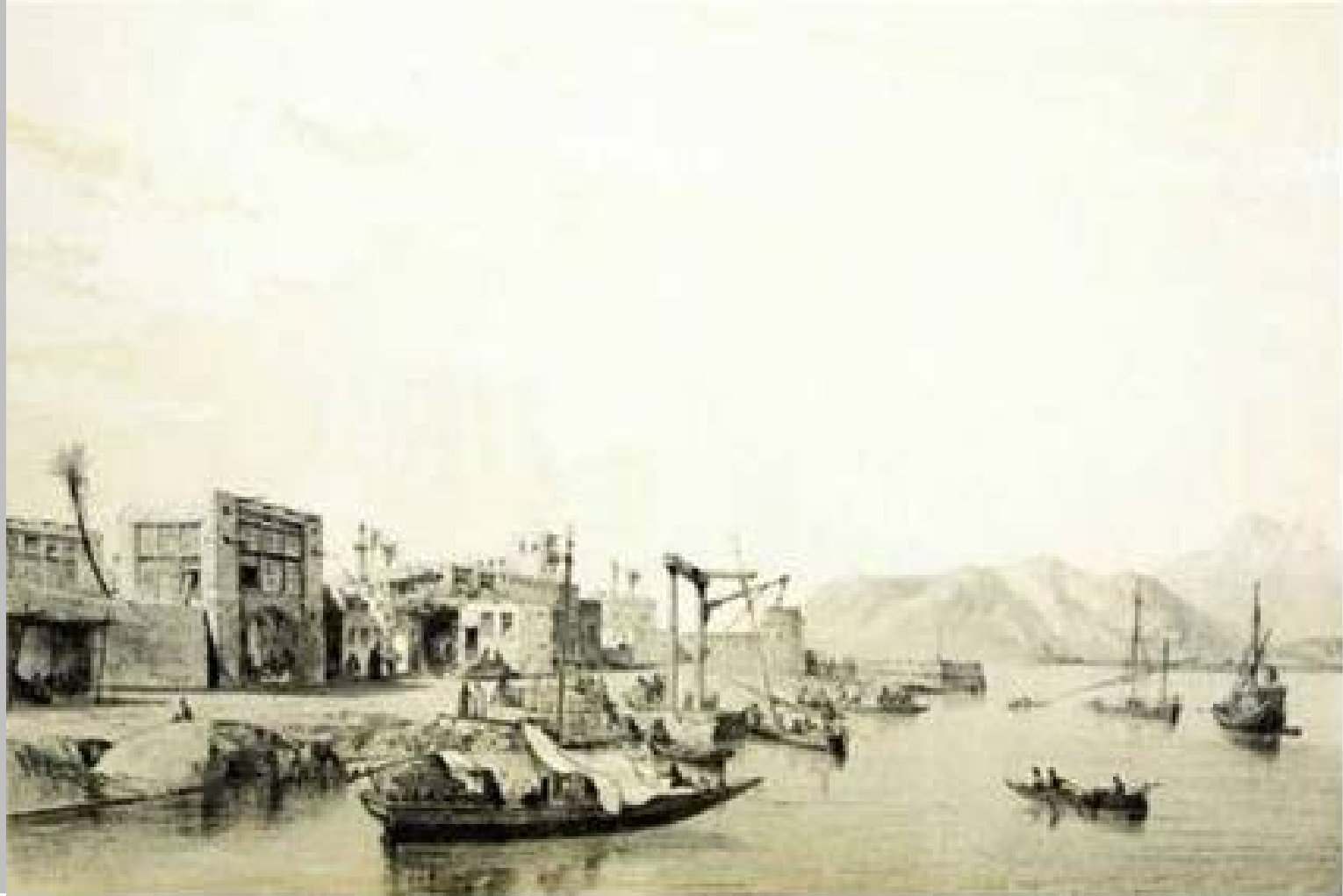
OLD IMAGE OF BUSHEHR BY FLANDIN (1840)