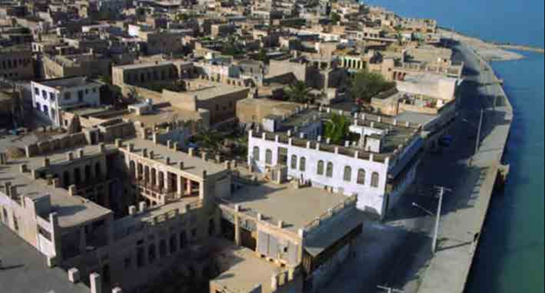
PICTURE OF THE HISTORICAL COASTAL AREA IN BUSHHR