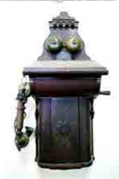
Decoration in Historical house in Bushehr