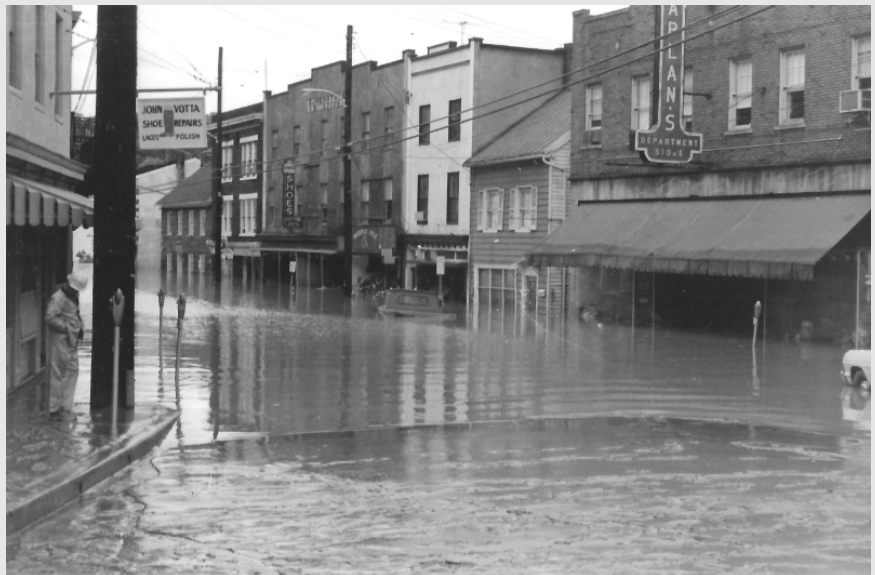
Flood waters on Main Street in Ellicott City, 1972.

Recently, the Kent Conservation and Preservation Alliance received a Heritage Fund grant from Preservation Maryland, as well as a grant from the